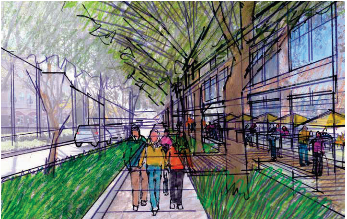
Potential redevelopment opportunity and outdoor dining along Main Street.