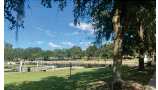
Shade trees along Main Street should be protected with any redevelopment concept.