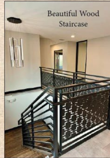
Beautiful Wood Staircase