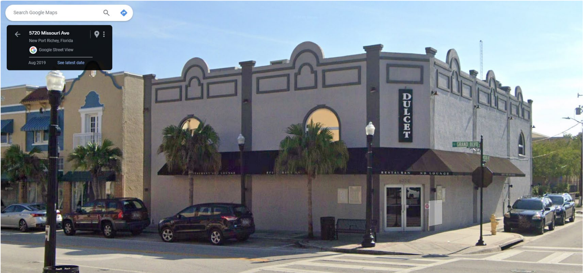
6220 Grand Boulevard/5727 Missouri Avenue, Suite 201—Before