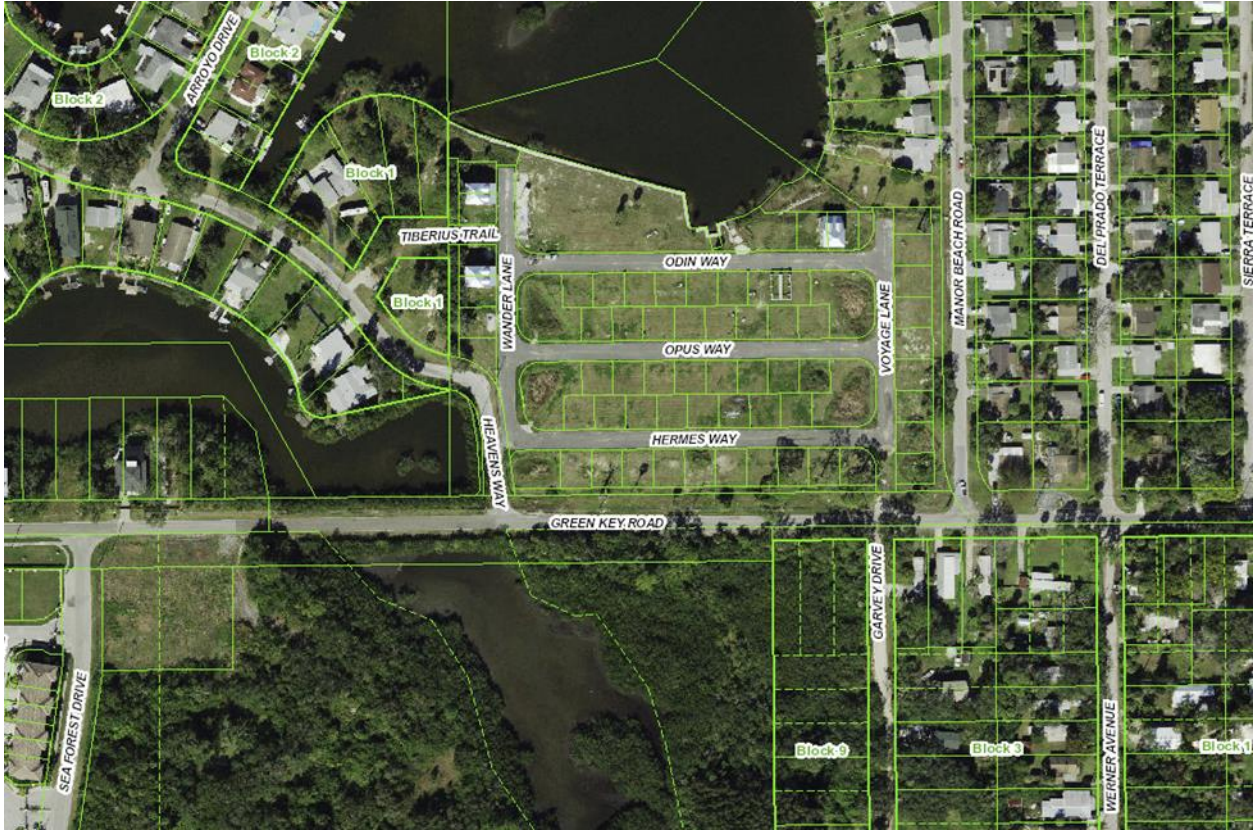
EXHIBIT A LOCATION MAP