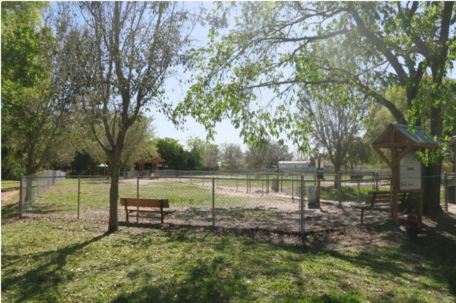
SMALL DOG PARK