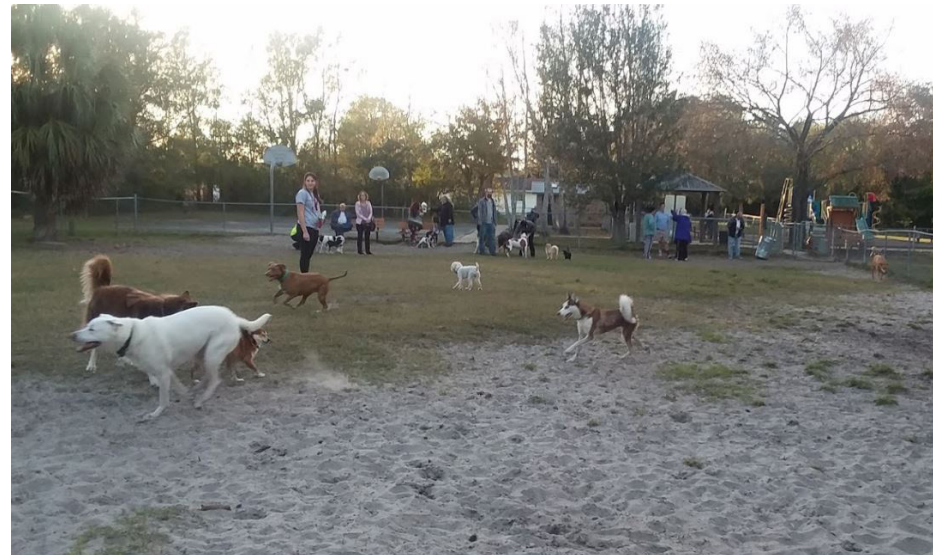
LARGE DOG PARK