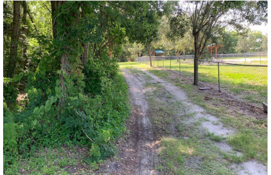
PATH NORTH OF SMALL DOG PARK