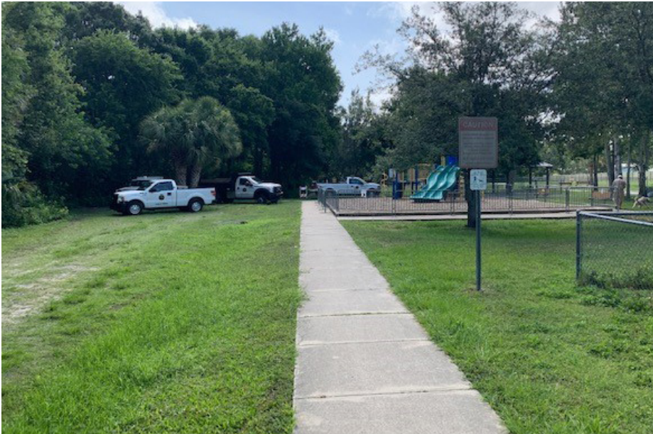
PARK ENTRY PATH