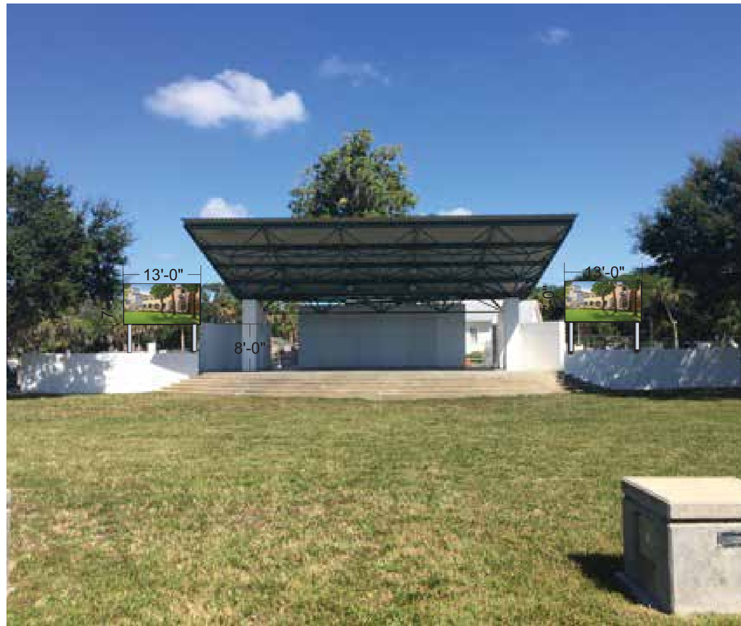
Proposed Elevation Updated Condition

EMC displays are rear vented and cannot be obstructed.