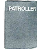
Protech Patrolter Level IIIA Shield 12x24