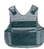
Protech FAV LP MR01 Level IIIA Vest Clean