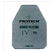
Protech 2230 Level IV Hard Armor Plate