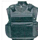
Protech FAV LP SM02 Level IIIA Vest Clean