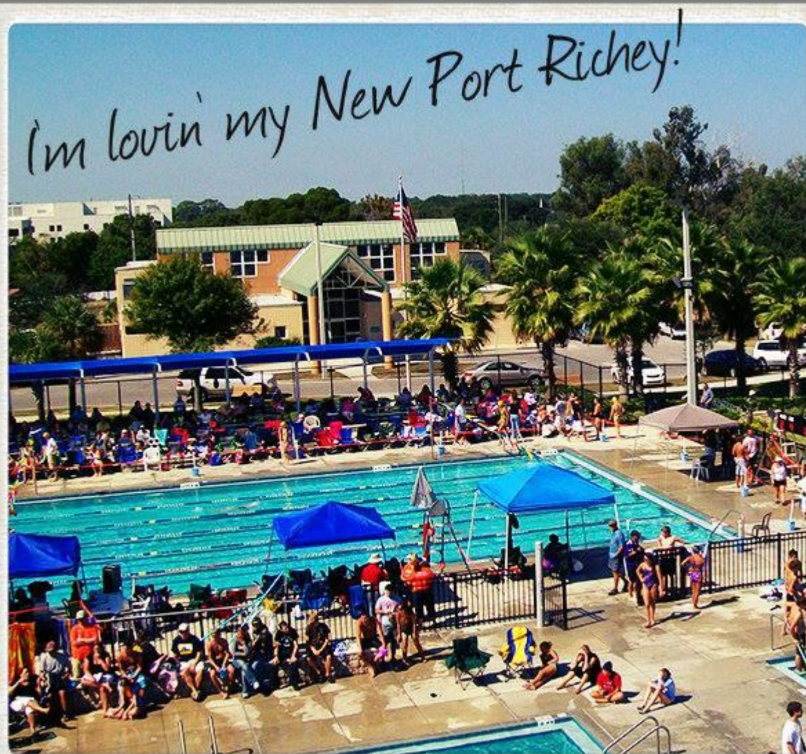
Fun times at the Aquatic & Recreation Center