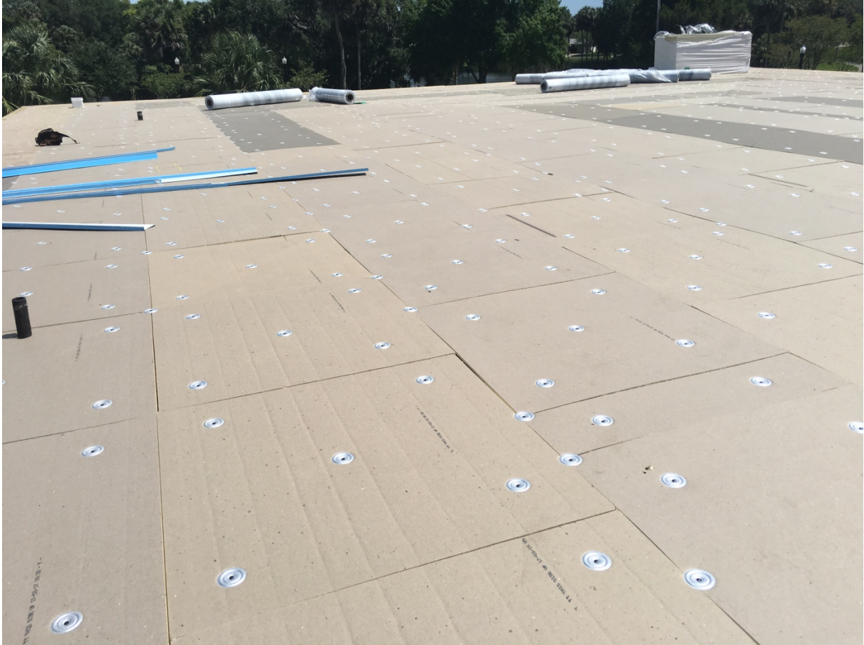
Figure 3 – Mechanical fastening of insulation boards

Field Observation Report Incubator Building – North Roof Area 6345 Grand Blvd. New Port Richey, FL 34652 BillerReinhart Project No. 16-502