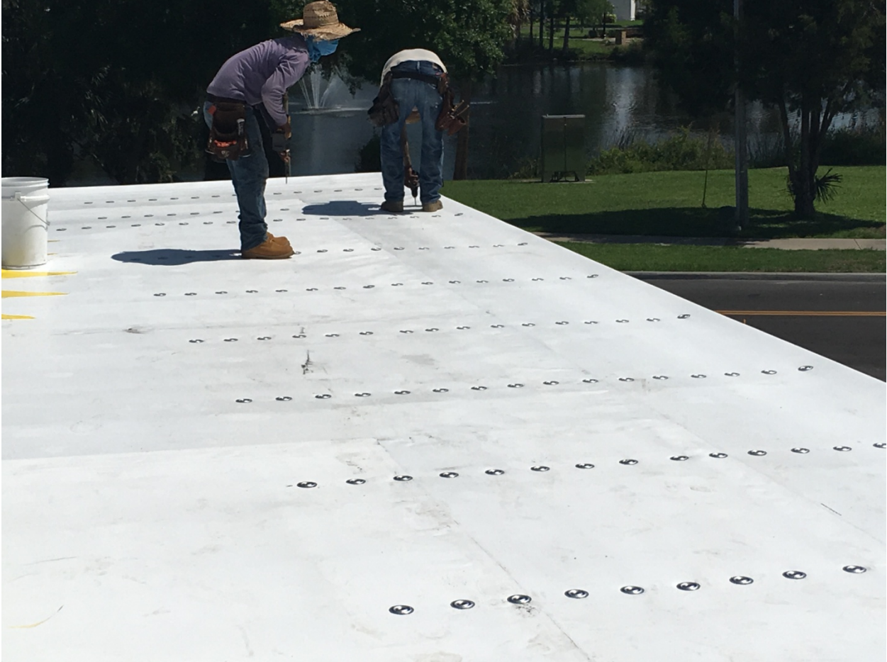
Figure 4 – Installation of Additional Membrane Fasteners Perpendicular to Roof Decking Flutes – Per Wind Uplift Requirements

Field Observation Report Incubator Building – North Roof Area 6345 Grand Blvd. New Port Richey, FL 34652 BillerReinhart Project No. 16-502