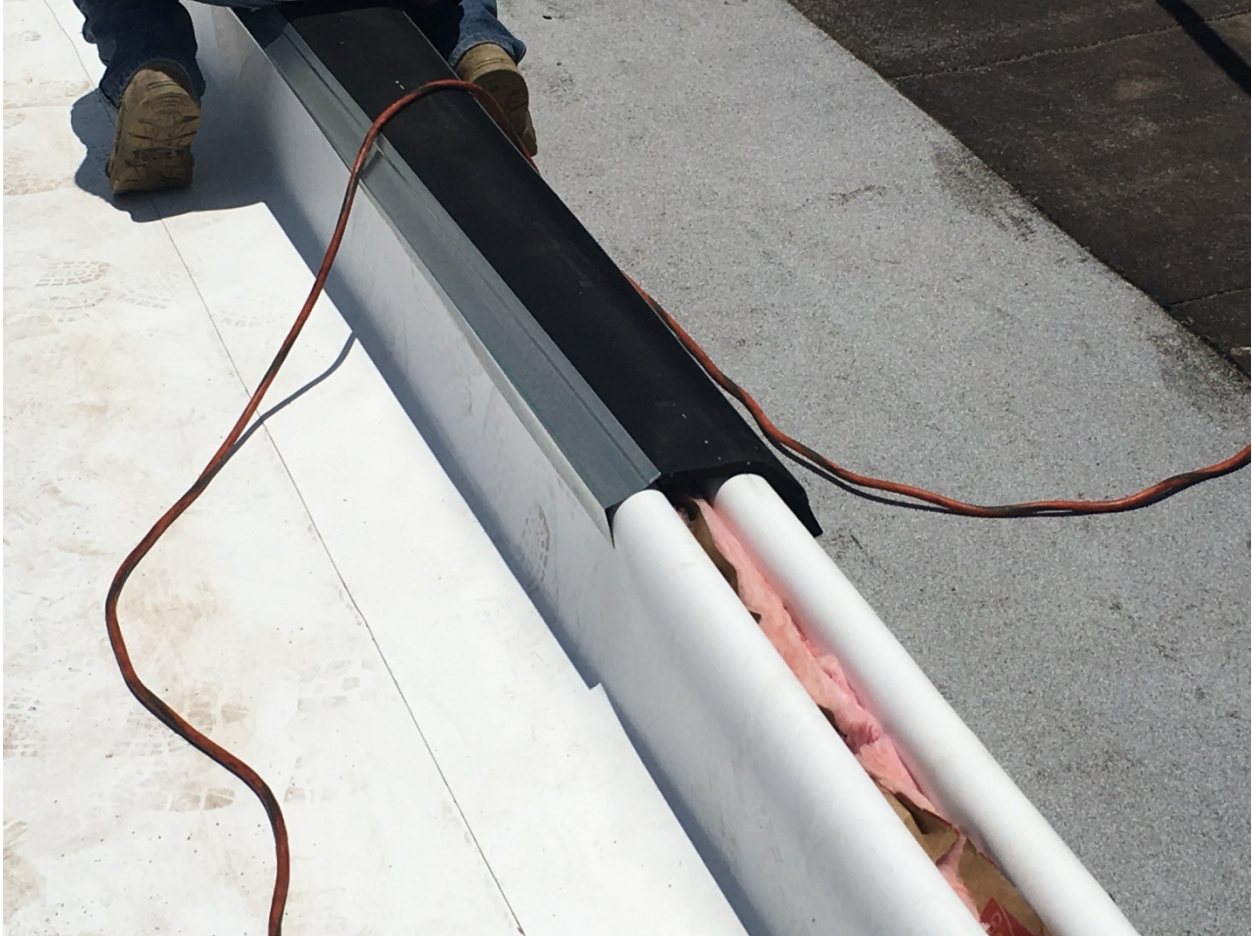
Figure 5 – Expansion Joint

Please note that construction observation by the engineer or engineer's staff does not relieve the contractor of his obligations under the under the construction contract – including but not limited to accuracy, means and methods of construction, and responsibility for jobsite safety.