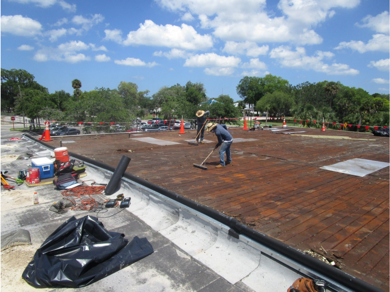
Figure 1 - North Roof Deck Area Looking NW

Field Observation Report Incubator Building – North Roof Area 6345 Grand Blvd. New Port Richey, FL 34652 BillerReinhart Project No. 16-502