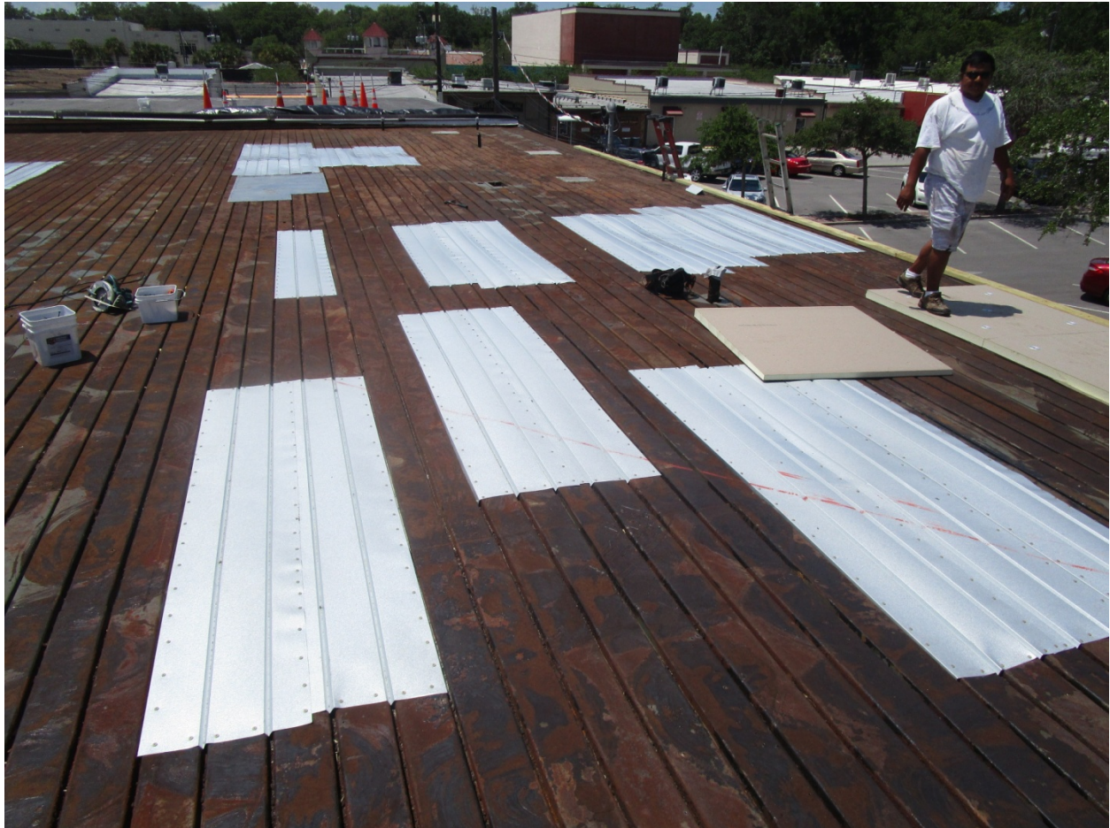
Figure 2 – Installation of supplemental deck panels

Field Observation Report Incubator Building – North Roof Area 6345 Grand Blvd. New Port Richey, FL 34652 BillerReinhart Project No. 16-502