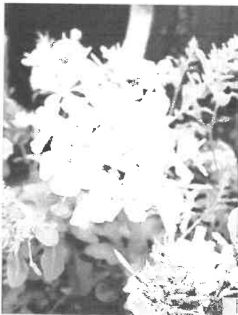
Image shown of mature plant; shop your local Lowe's for plants specific to your growing zone; not for human or animal consumption