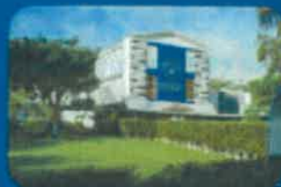
Keiser University's Latin American Off-Campus Site

Recognizing Florida as the critical gateway to the worldwide economy, Keiser University's international presence transcends many borders, with students from 47 different countries enrolled in our degree programs. Offering academic support to online students in the nations of Moldova and South Korea and with SACS accredited off-site campuses in Shanghai, China and San Marcos, Nicaragua, the University continues to provide workforce talent prepared to make a positive impact in the global marketplace. Keiser University's International Division also offers several degrees in Spanish and Mandarin.