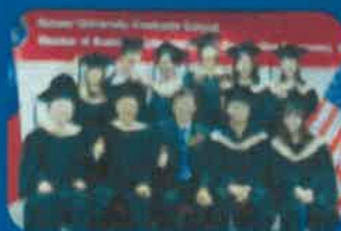
Keiser University's Shanghai Off-Campus Site