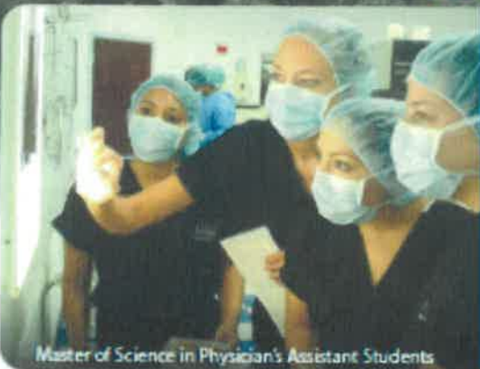
Master of Science in Physician's Assistant Students