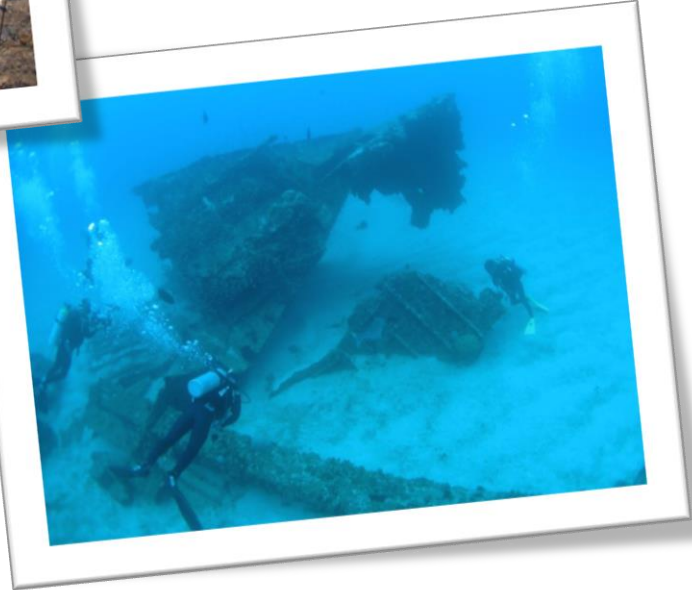
Underwater Excavation - Florida