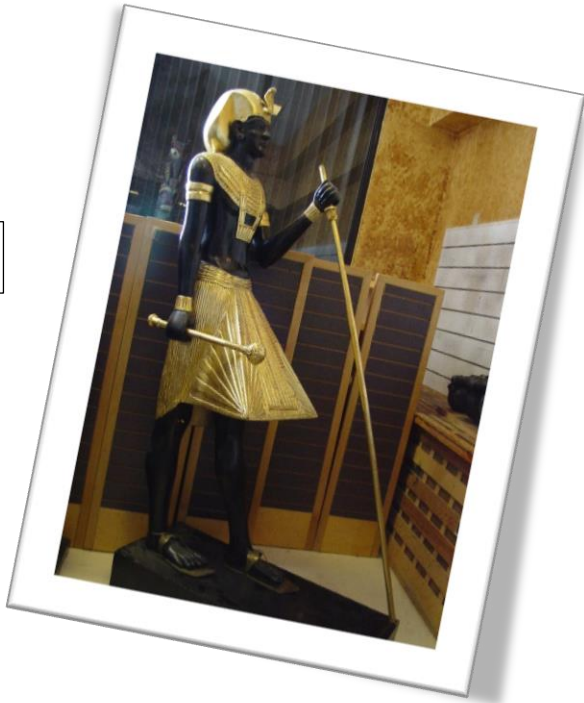
Greek & Roman