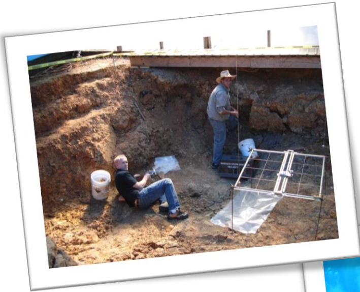
Dinosaur Dig – Western US