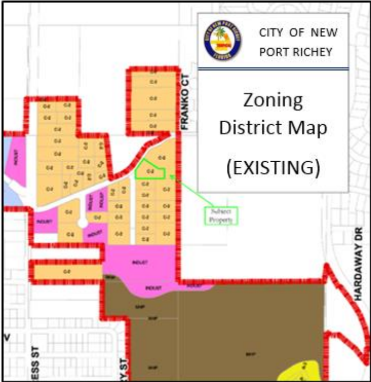
EXHIBIT A ZONING DISTRICT MAP CHANGE