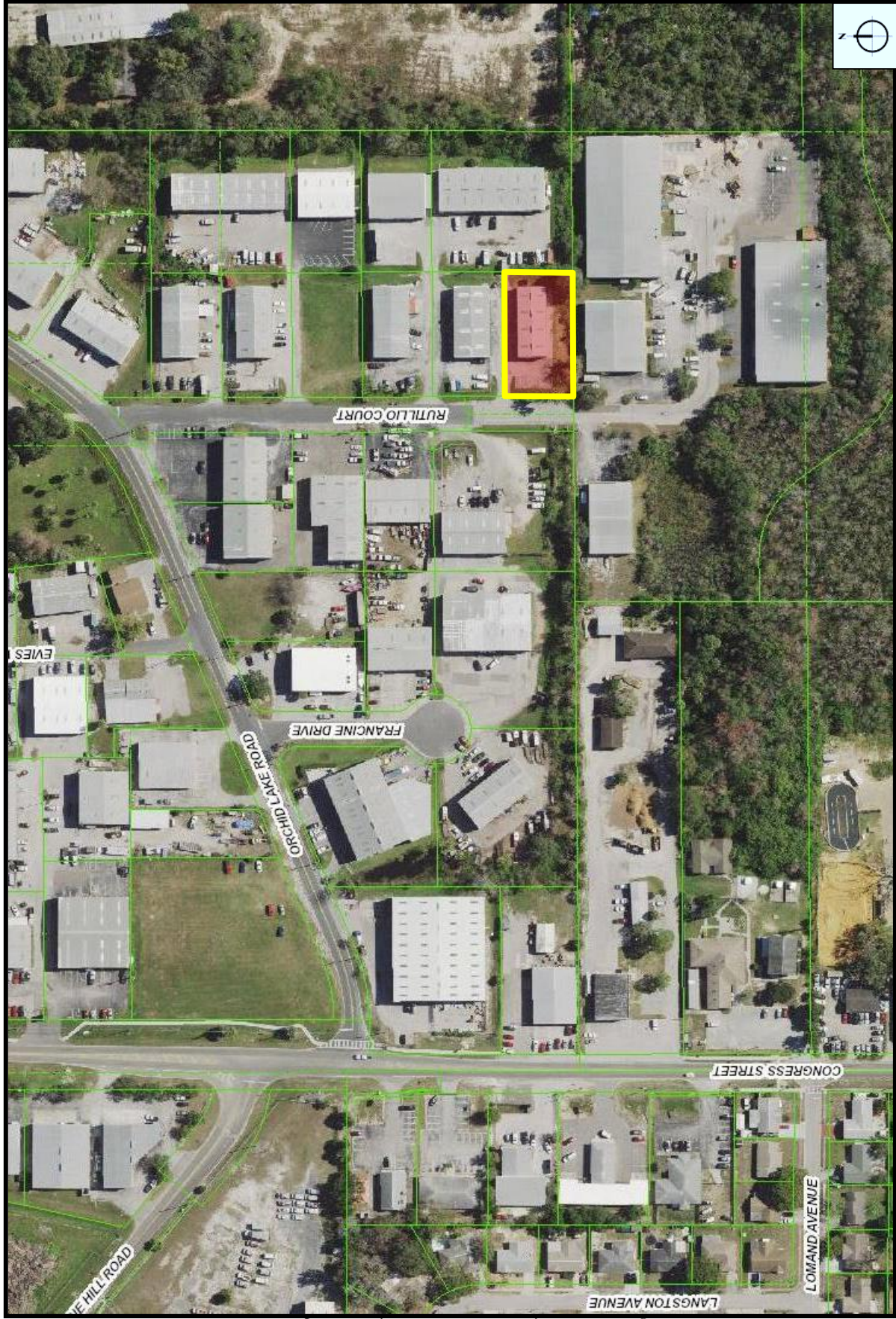
Subject Property – 7944 Rutillio Court